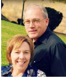
Butch Suttty MOUNTAIN MIXER 6/4-5 MS w Plus