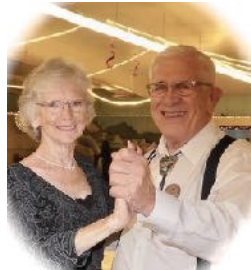
Krueger & McNair Ph 4 figures 6/14-17 Ph 3/4 weekend 6/18-20 Ph 5+ figures 6/21-24 Latins Blast Class 7/26-30